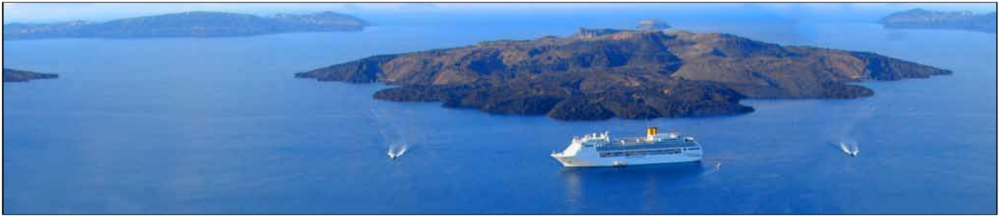
It's all that remains of the legendary Atlantis - one of the Greek Isles called Santorini. Luxury cruise ships from Venice stop at this tourist attraction to give visitors an opportunity to explore it. Only the island's outer rim and center volcanic island remain.