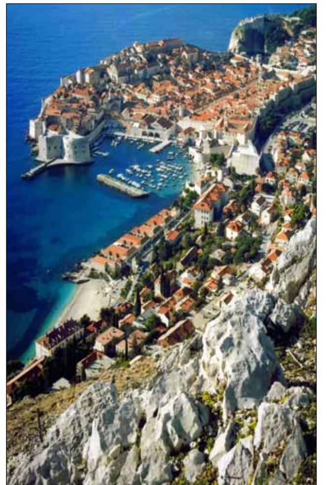
Overlooking the charming old town of Dubrovnik with its walls surrounding it.

Leaving these two magical Greek Isles behind, the enchanting capital Athens awaited our next visit on the horizon. The ancient city with a glorious history is often called the birthplace of civilization and democracy, a center for arts and philosophy, and home to Plato and Aristotle's teachings. What would a visit to Athens be without going to the Acropolis to see the Parthenon, one of the most perfect buildings by the world's most advanced civilization? One studied for centuries and we still have not figured