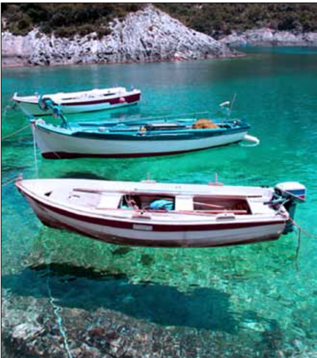
Coastal fishing boats seem indifferent to time or weather as they float in the crystal clear waters of Mykonos.

I asked how much..., and how much bigger than a gondola was this boat leaving from Venice. I was shocked at both responses. For less than $500 per person, Lori and I could live on a majestic ocean liner, cruise the eastern Mediterranean for eight days with exotic ports of call, while enjoying all our catered meals and entertainment provided for no additional cost. I took